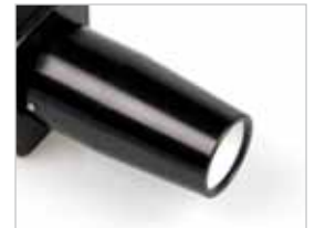
Close focus module