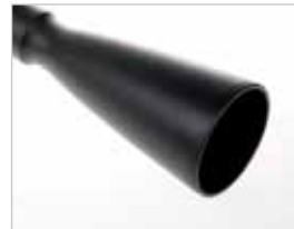
Long range module