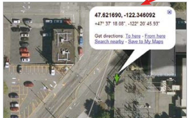
Reporter 8.5 supports the embedded GPS feature in FLIR's P660, B660, and SC660 cameras. Downloaded images contain GPS coordinates. By clicking the icon, you can see a satellite image, get address information, even street directions to add to your report if needed. (The green arrow shows the FLIR camera position).